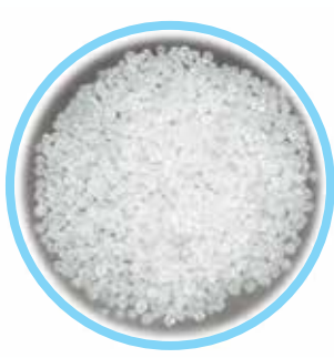
4mm – 5mm Biofilter media

Mechanical filtration physically removes solids from the pond by trapping solids between the crevices of the filter media.