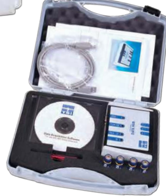
Data Hub for infrared data transfer