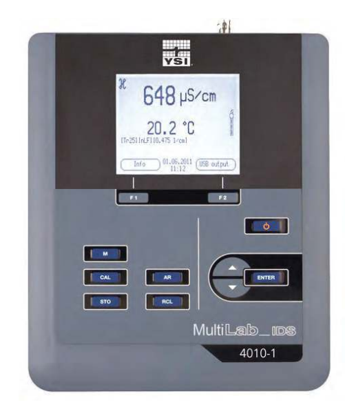
MultiLab 4010-1 Single channel

• One-channel input for pH, ORP, DO/BOD, or conductivity