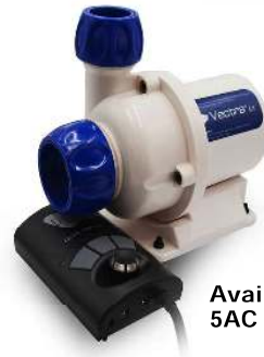
Available Vectra L1/L2 DC Pump For 5AC Model