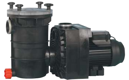
43 Series Pump with giant strainer (GS) *available on request