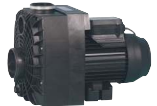
43 Series Pump with no strainer (NS)