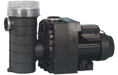
43 Series Pump with large strainer (LS)

* Five (5) Year Factory Warranty on the following wet end components: Casing, Diffuser, Gland Housing, Impeller and Mechanical Seal. Two (2) Year Warranty on motor and in all commercial applications. The pouring of salt and chemicals directly into the skimmer box will void full warranty.