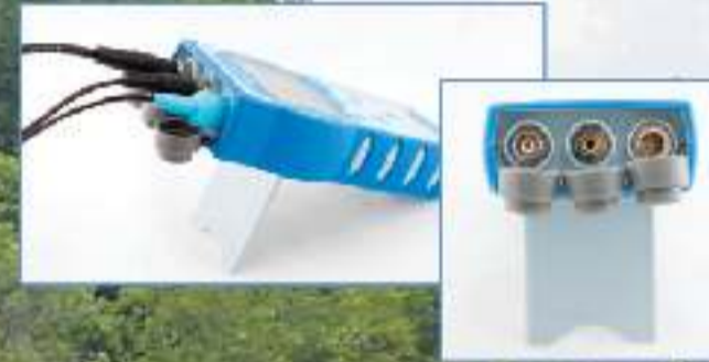
Connections for probes