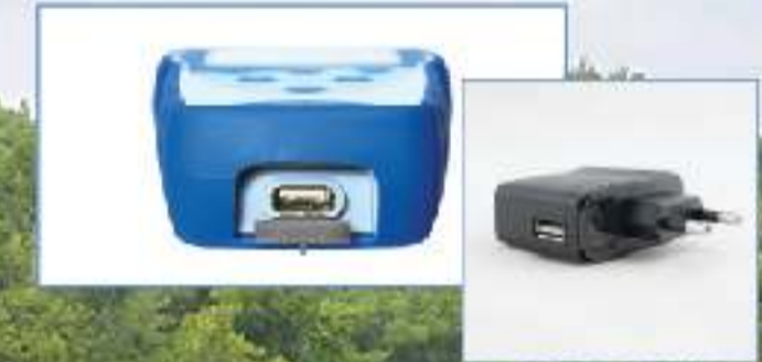
USB port for data transfer and power supply