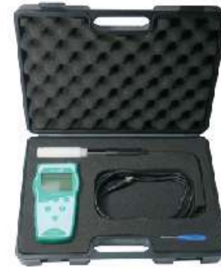
Comes in strong carry case