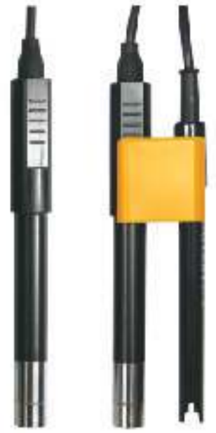
Advanced Optical Sensor